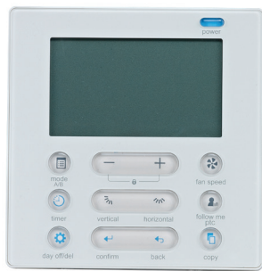
Wired thermostat PART NO. 89-WSTAT