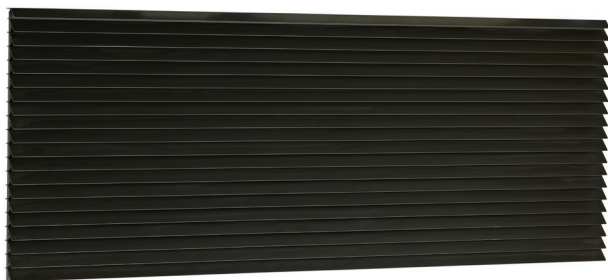
Grey architectural grill PART NO: 89AAG-G1