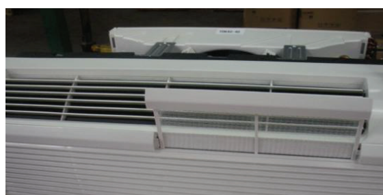
Easy to clean filter position.

Large ventilation door: lets more fresh air into the room, and makes for a quick air exchange.