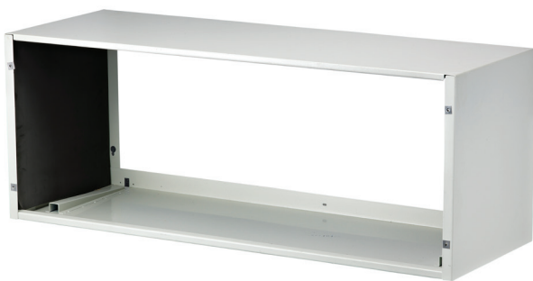
Foldable wall sleeve PART .NO 89WS2